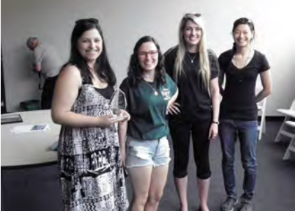
The Young Kookaburra Award recipients

Improving Health Benefits Award, Individual Achievement Award, Kookaburra Aboriginal Award, Young Kookaburra Award, Kookaburra Lifetime Achievement Award and the Kookaburra Multicultural Award.